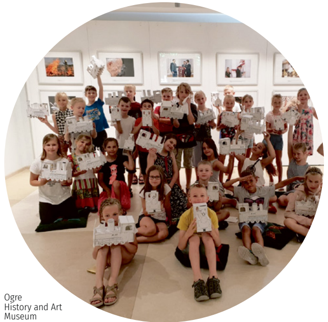
Ogre History and Art Museum