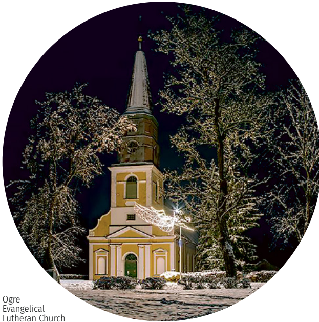
Ogre Evangelical Lutheran Church