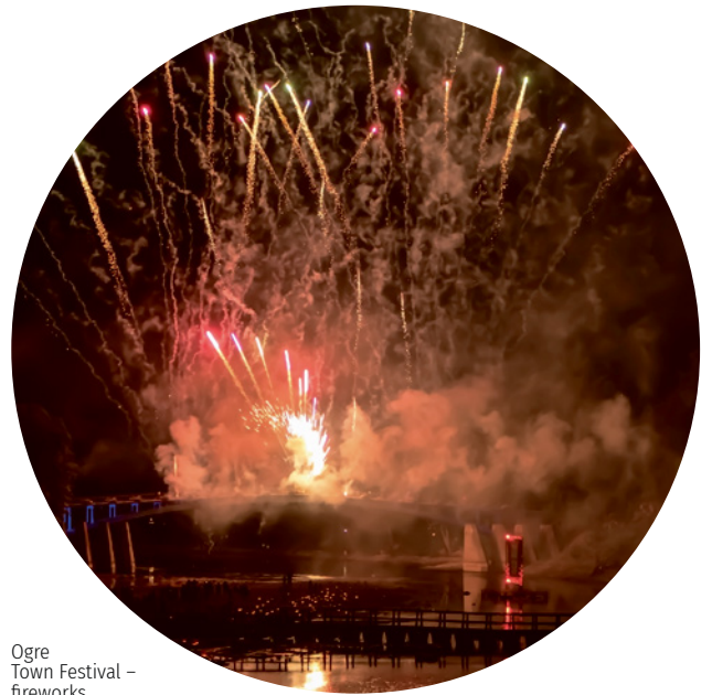
Ogre Town Festival – fireworks