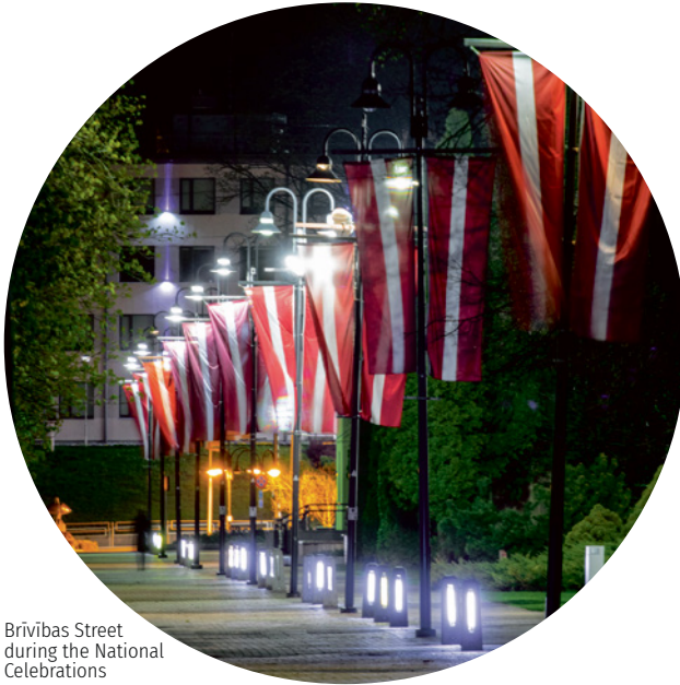
Brivibas Street during the National Celebrations