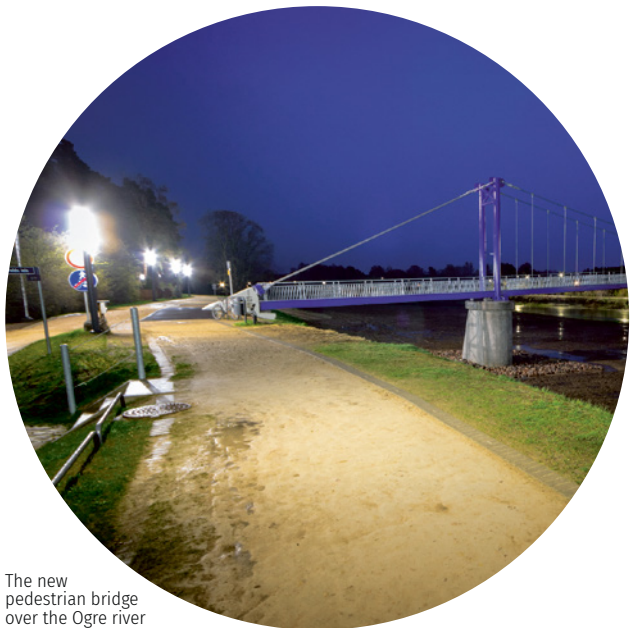
The new pedestrian bridge over the Ogre river