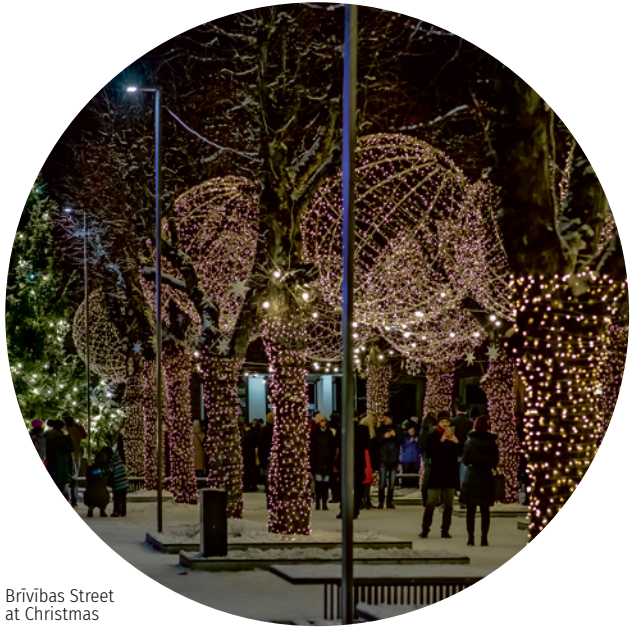
Brivibas Street at Christmas