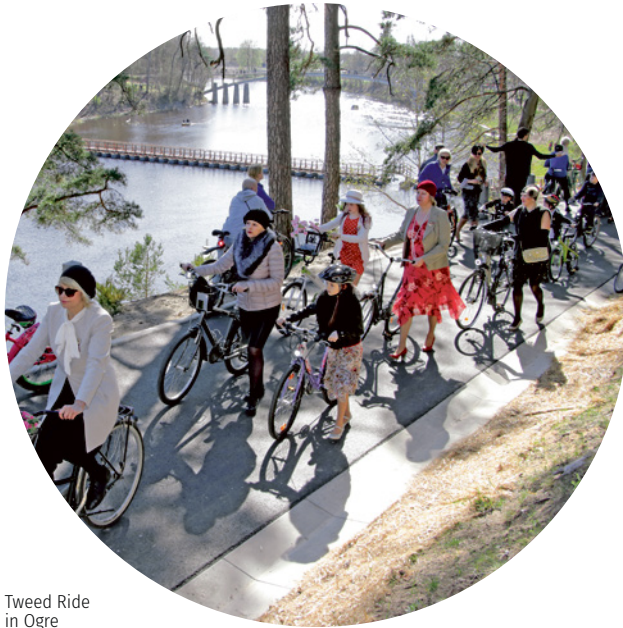
Tweed Ride in Ogre