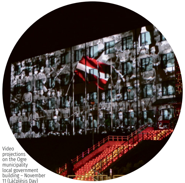
Video projections on the Ogre municipality local government building – November 11 (Lāčplēsis Day)