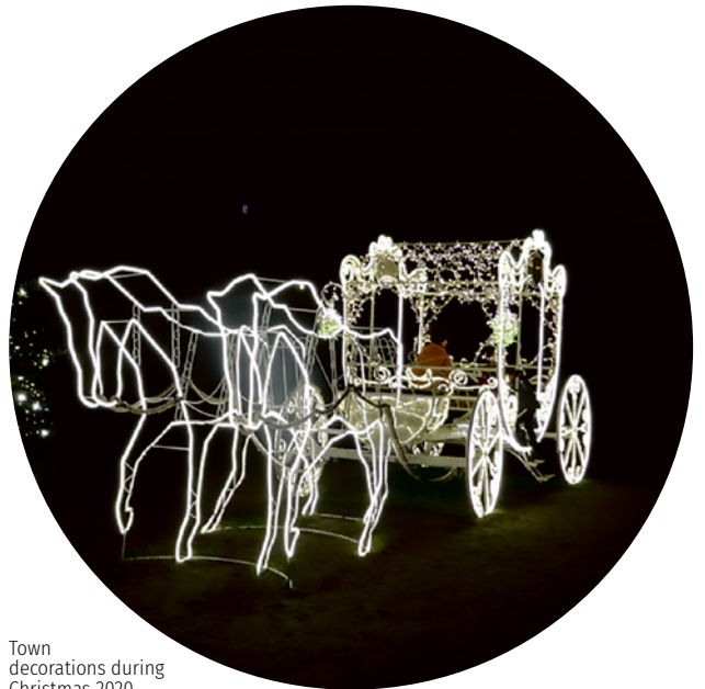
Town decorations during Christmas 2020