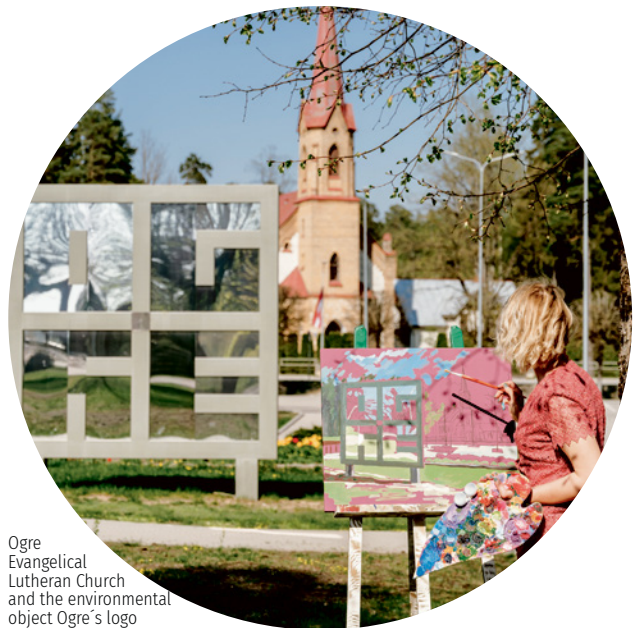
Ogre Evangelical Lutheran Church and the environmental object Ogre's logo