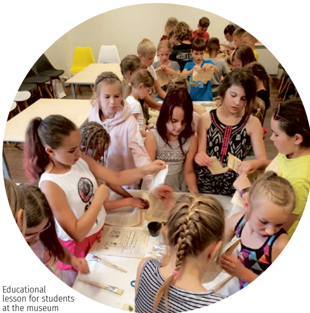
Educational lesson for students at the museum