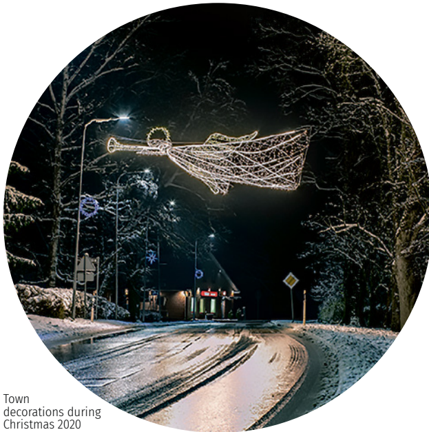
Town decorations during Christmas 2020