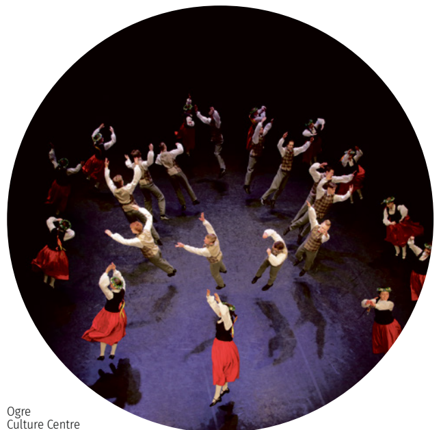
Ogre Culture Centre