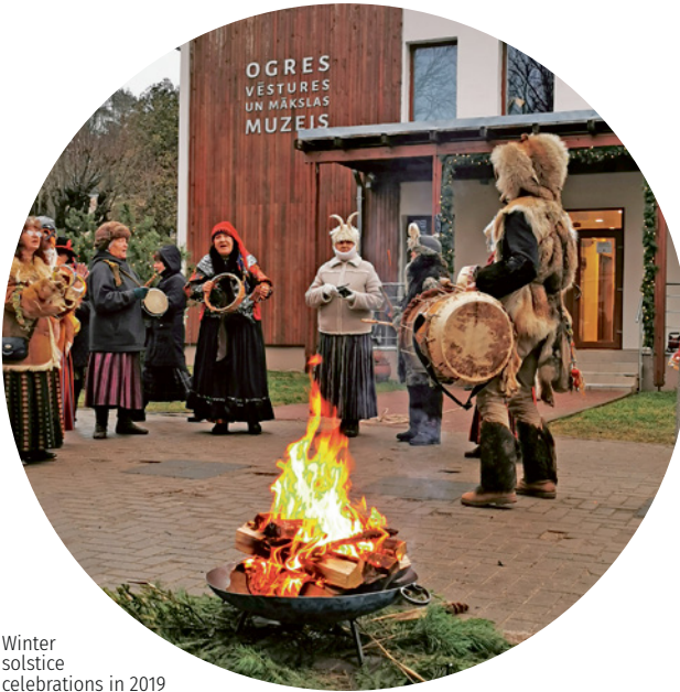
Winter solstice celebrations in 2019