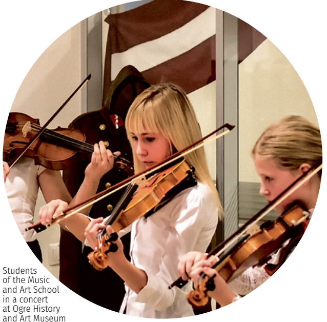
Students of the Music and Art School in a concert at Ogre History and Art Museum