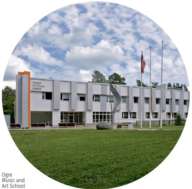
Ogre Music and Art School