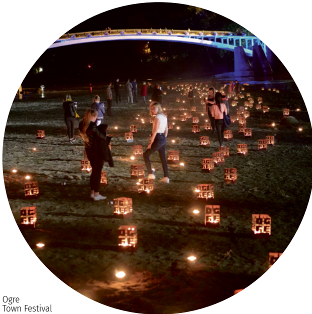
Ogre Town Festival