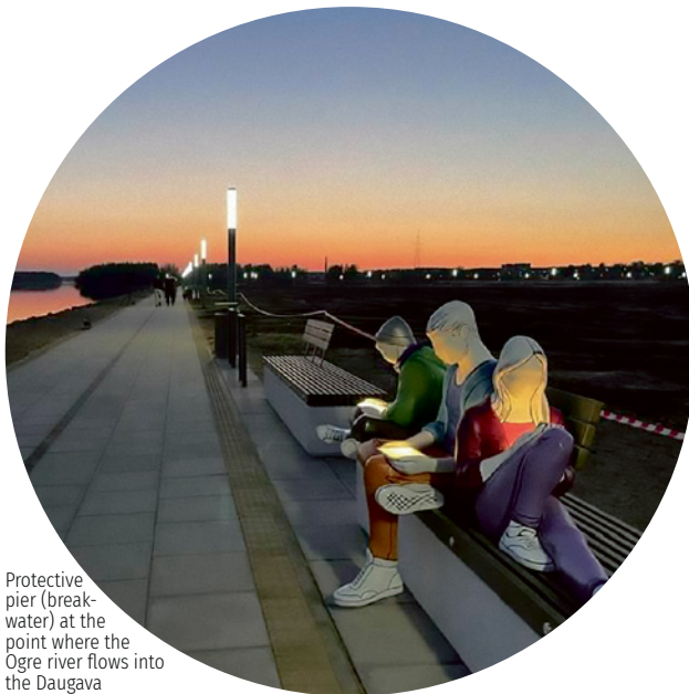
Protective pier (break-water) at the point where the Ogre river flows into the Daugava