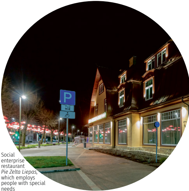
Social enterprise restaurant Pie Zelta Liepas , which employs people with special needs