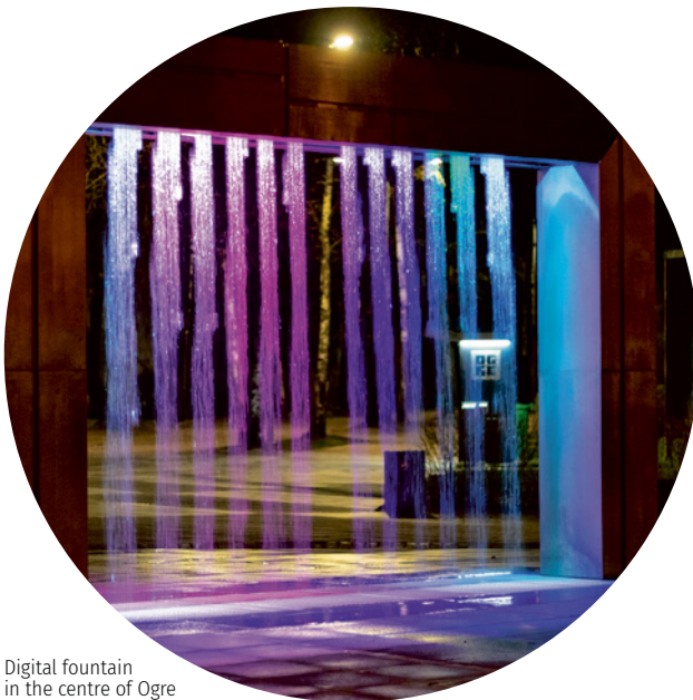
Digital fountain in the centre of Ogre