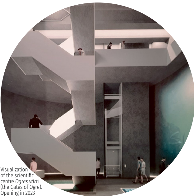
Visualization of the scientific centre Ogres vārti (the Gates of Ogre). Opening in 2023