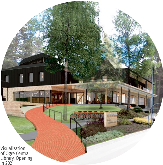
Visualization of Ogre Central Library. Opening in 2021