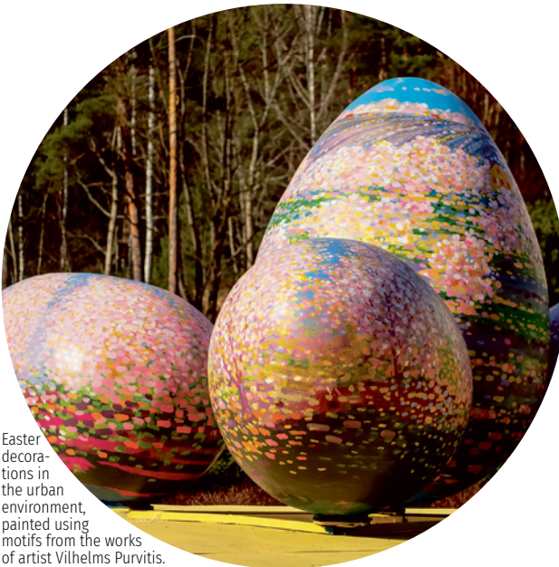
Easter decorations in the urban environment, painted using motifs from the works of artist Vilhelms Purvītis.