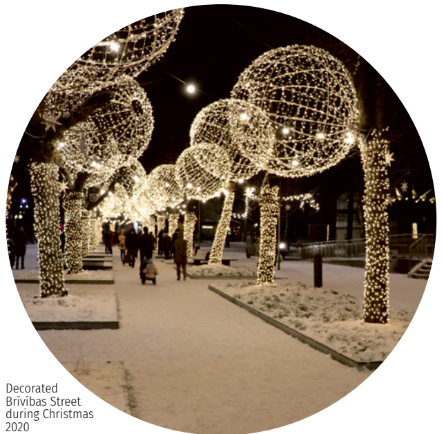
Decorated Brivibas Street during Christmas 2020