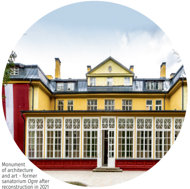
Monument of architecture and art – former sanatorium Ogre after reconstruction in 2021