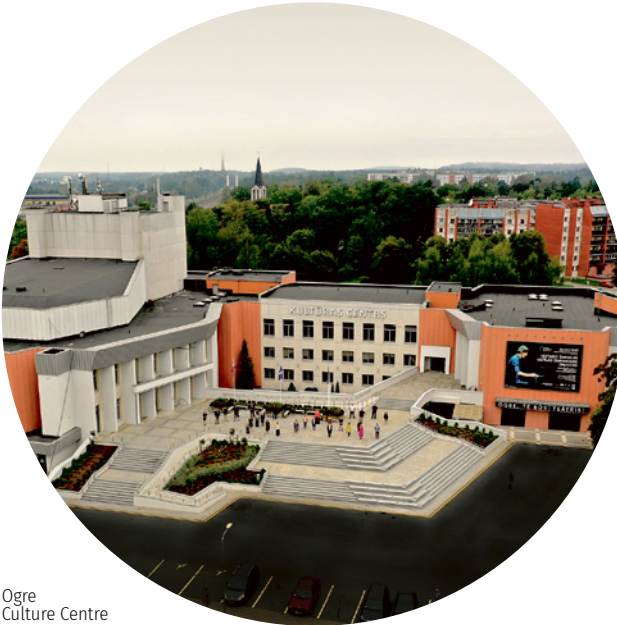
Ogre Culture Centre