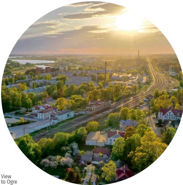
View to Ogre