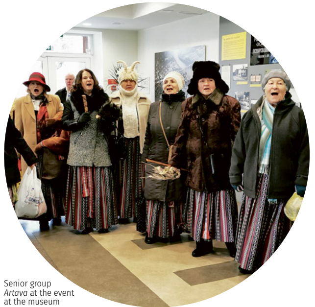
Senior group Artava at the event at the museum