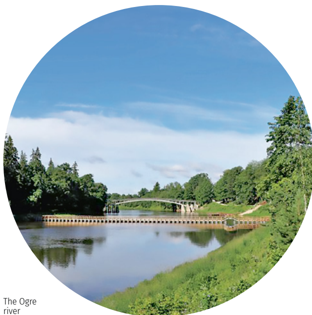
The Ogre river