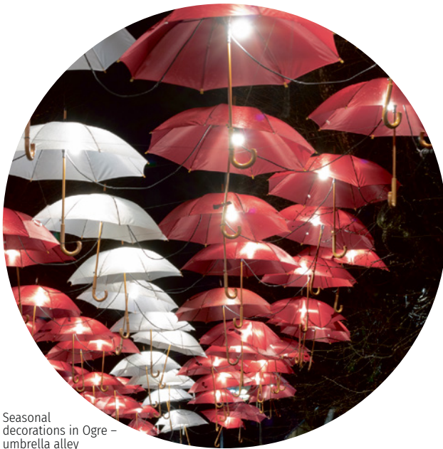
Seasonal decorations in Ogre – umbrella alley