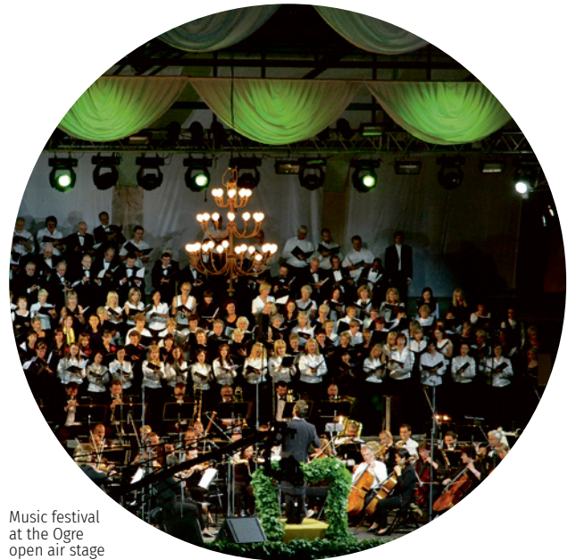
Music festival at the Ogre open air stage