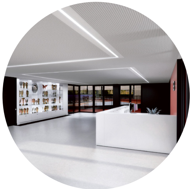
Visualization of Ogres New Gymnasium. Opening in 2022